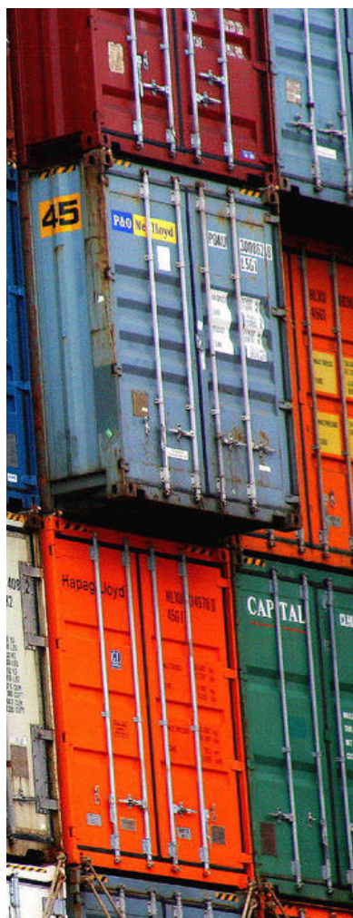
Freight containers at a California port

This should be recognised in the policies, governance mechanisms, financial provisions and international negotiations at the global level that facilitate adaptation.