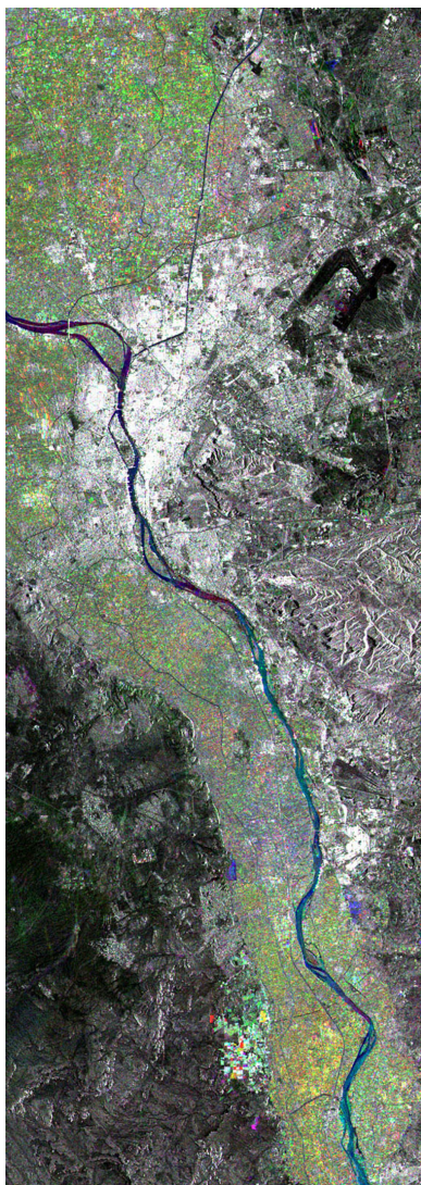
A satellite image of the Nile Delta, Egypt

The recent UNEP Adaptation Gap Report 19 provides an overview of how to assess the global goal on adaptation, but it clearly assumes that the goal's achievement will be built on aggregated national actions. We recommend that its achievement also be understood as the product of adapting to transboundary risks, whether this takes place at the national, regional, transnational or global level. Metrics for assessing progress towards the goal should therefore not be constrained to metrics designed for assessing national-level adaptive capacity, resilience or vulnerability. In addition, they should include a way to track transboundary risks (i.e. climate impacts, and collateral effects of adaptation choices), in order to also capture regional and global adaptive capacity, resilience and vulnerability. The indicator set proposed in the Transnational Climate Impacts Index 13 offers one starting point for developing such metrics.