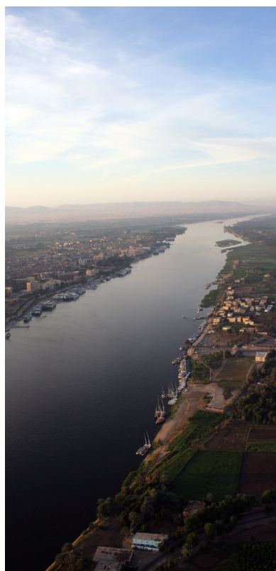
Aerial photo of the River Nile

NAPs have the potential to be used as a component of, or vehicle for, adaptation communications, though progress in preparing NAPs has been slower than many hoped. As of February 2018, only 10