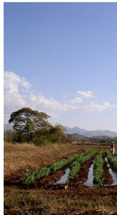
An irrigated field in the Limpopo Basin, South Africa

However, there are also reasons for optimism. The concept of transboundary climate risk appears to be rising in discussions and planning activities, especially by many developing countries. Two NAPs, submitted by Sudan and Burkina Faso, outline transboundary risks. 14 The NAP technical guidelines produced by the Least Developed Countries Expert Group identifies the importance of promoting synergy and coordination at the regional level, including to reduce the impacts of transboundary risks. 15 Additionally, several countries have identified transboundary climate risks in their NDCs. Regional adaptation is a priority for Angola, for example, which described its collaboration with Namibia and South Africa to reduce the vulnerability and increase the adaptive capacity of the Benguela fisheries system. 16 Guinea’s NDC explicitly recognises the country’s