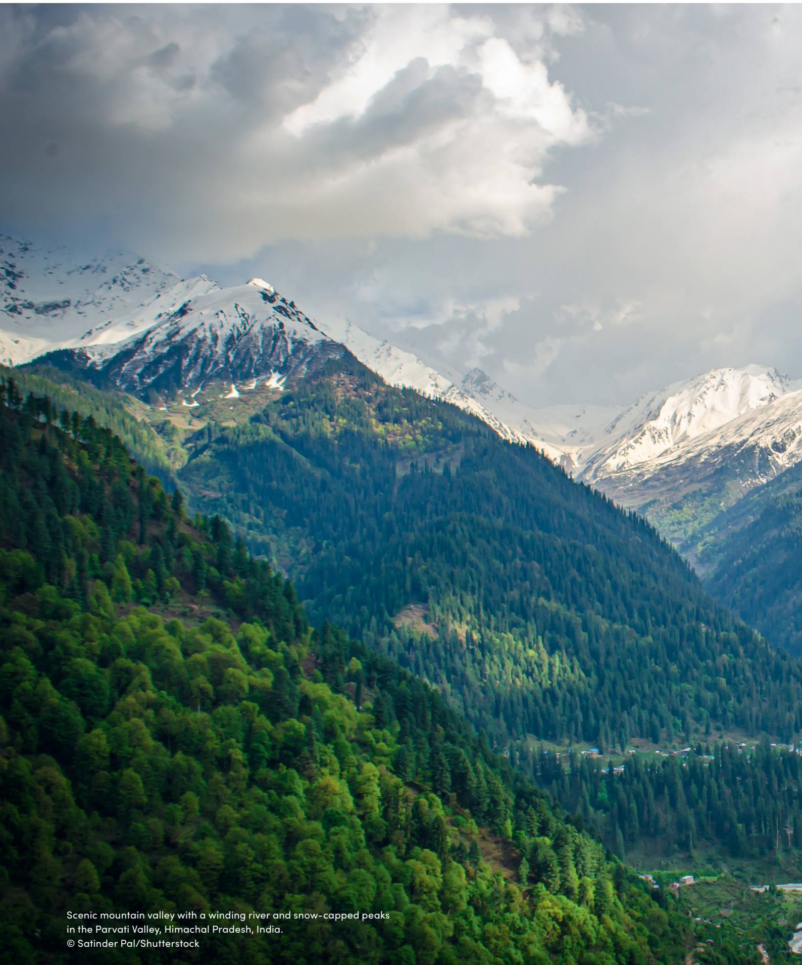
Scenic mountain valley with a winding river and snow-capped peaks in the Parvati Valley, Himachal Pradesh, India.